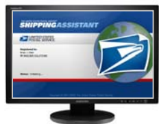
USPS® Shipping Assistant Software