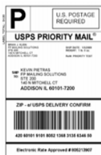
USPS® Barcoded Shipping Label