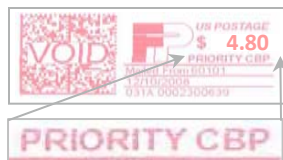
IBI Postage Meter CBP Indicia