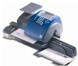
FP IBI Compliant Postage Meter